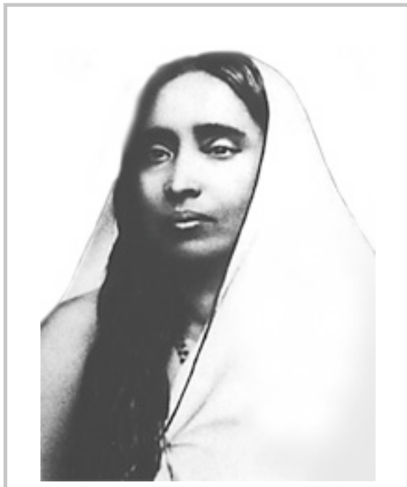
HOLY MOTHER SRI SARADA DEVI 150th BIRTH ANNIVERSARY