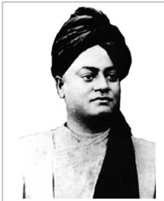
SWAMI VIVEKANANDA 142nd BIRTH ANNIVERSARY

All, with family and friends, are cordially invited to attend!