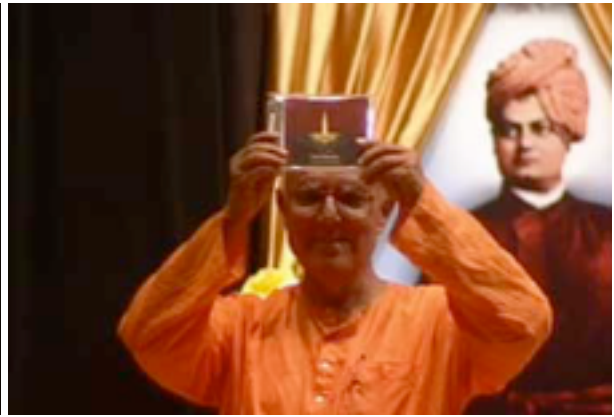
Swami Prameyananda releases new CD on Guided Meditations